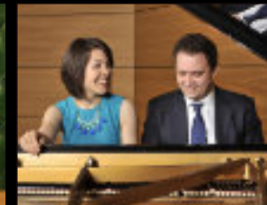
TRICK & ALDERIGHI